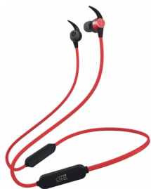
Model Number: NBB1